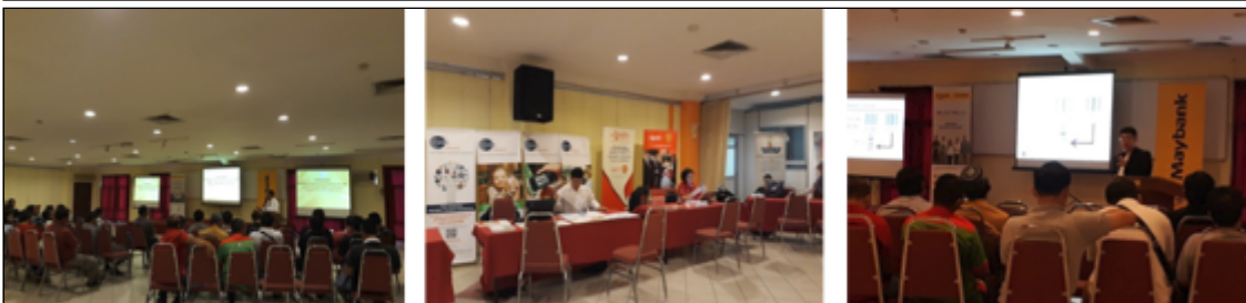
Event at Setiawan, 17th May 2017