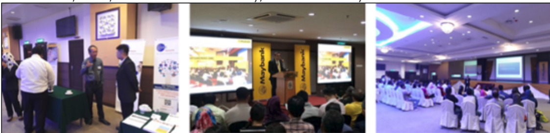
Event in Taiping on 16th May 2017

Exhibitors included Maybank's financing arm (Maybank SME, Maybank2U), Etiqa, MARTRADE, CGC, AladdinStreet.com.my, and GS1 Malaysia Berhad.